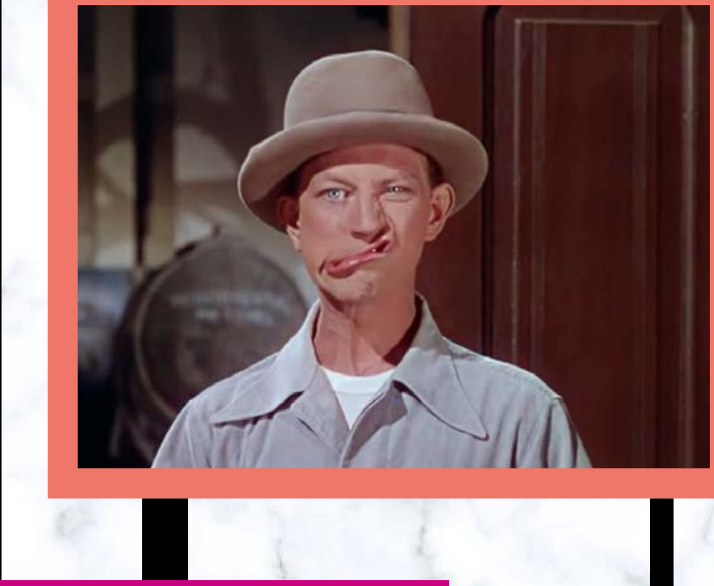
Click on the picture to watch a clip from Singin' in the Rain ! It will be sure to "make you laugh"!

The Golden Age of Musical Theatre was a time like no other and is an important part of musical theatre history. The 1940s and 1950s saw this musical prosperity, not just on the stage, but on the screen as well! The classic film , Singin' in the Rain , is a wonderful example of the Broadway and Golden Age influence on screen!