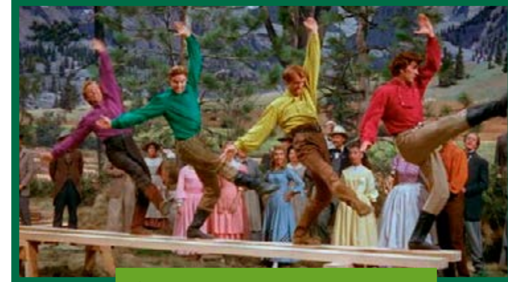
The Barn Dance