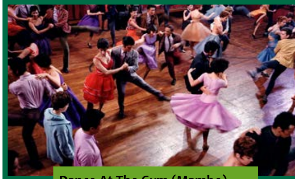
Dance At The Gym (Mambo)