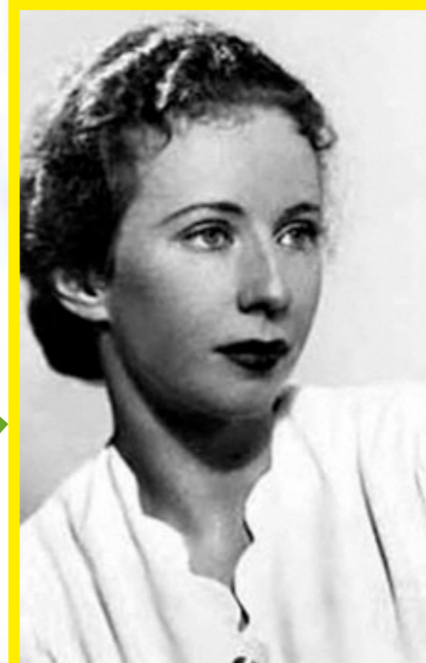
AGNES DE MILLE

A praised choreographer and director, Robbins utilized dance to propel the story forward. As seen in West Side Story , the conflict in the prologue is told through dance. Other original shows he choreographed included Peter Pan , Gypsy , and Bells Are Ringing . Robbins also directed and choreographed the original Broadway production of Fiddler on the Roof .