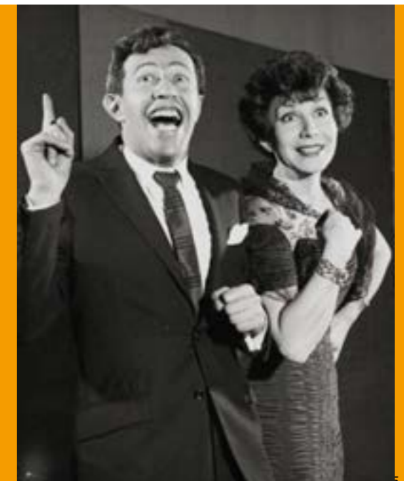
3D - Lerner & Loewe

They brought us the famous musical, My Fair Lady .