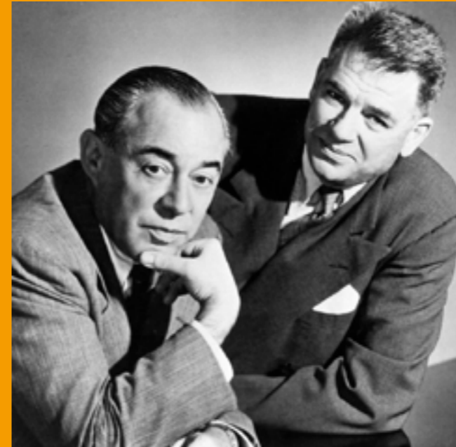
1C - Rodgers & Hammerstein

Known for their shows Oklahoma! , Cinderella , Carousel , and much more.