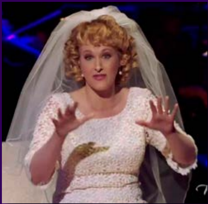
Not Getting Married Today from Company