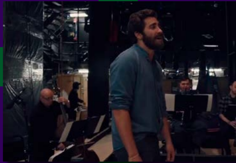
Finishing The Hat from Sunday In The Park With George