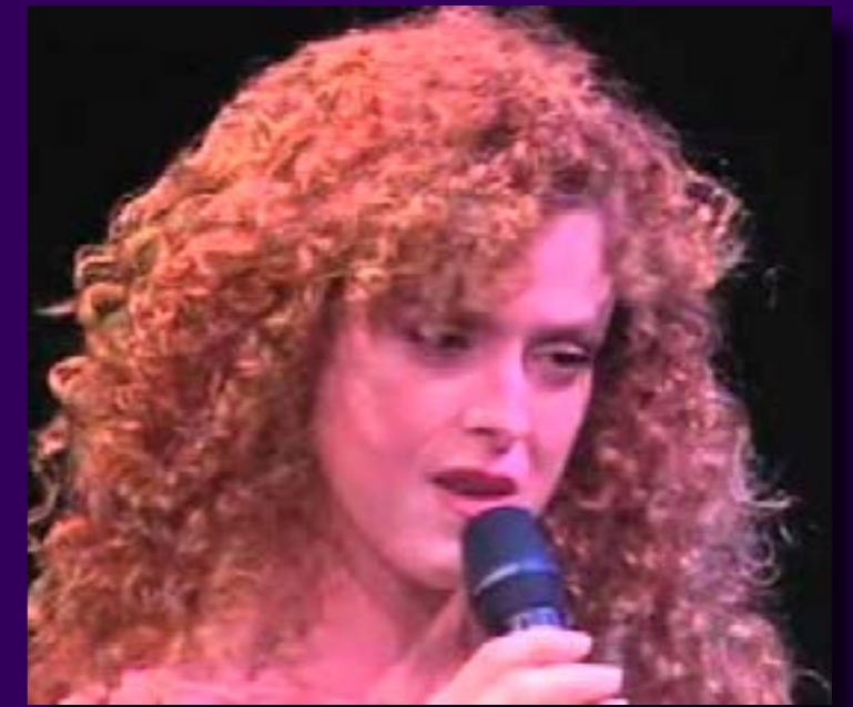
No One Is Alone from Into The Woods