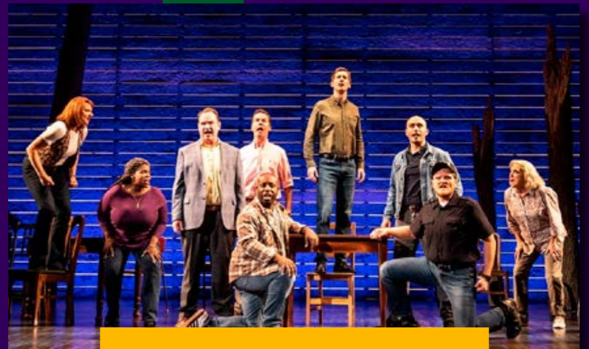
Come From Away